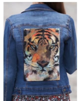
To Fabulous Fashion