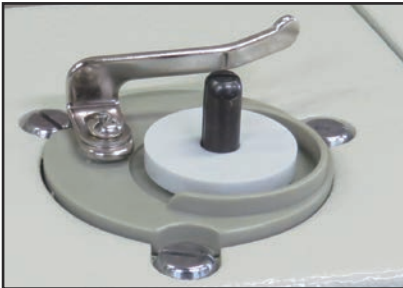
Built-in bobbin winder