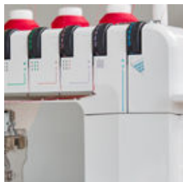
5 colour easy threading guide