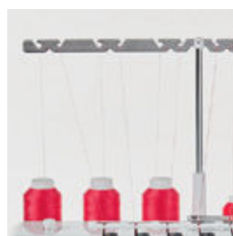
Telescopic metal thread stand