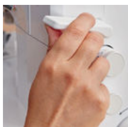
Automatic release of the thread tension