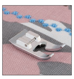
Candlewicking foot For sewing candlewick stitch.

For sewing quilt bindings or concealed seams on clothes.