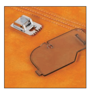
5 Groove pin tuck foot For making pin tuck with large interval.

Straight stitch foot and needle plate for perfect straight stitching.