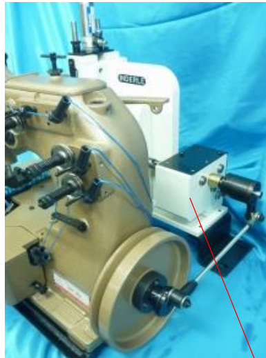
INSTALLED ON THE MACHINE