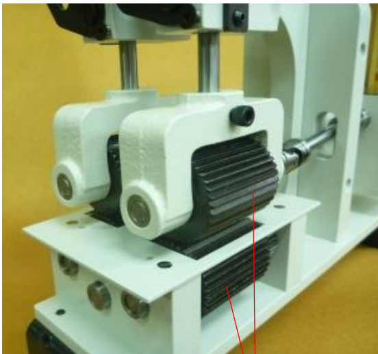
2 TOP AND 2 BOTTOM GEAR ROLLERS

IDL-2605 Powerful 4x4 Twin Puller is made for IDL-81300 IDL-81500 and IDL-4 series. It has two top and two bottom gear rollers which pull the material forward. It use the Air Foot Lifter system which consist of air cylinder and foot switch to control the gear roller lifting.